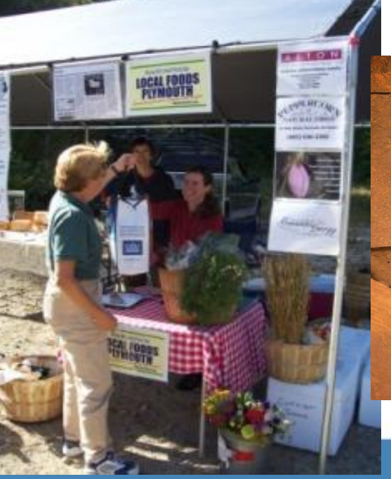
Regional Food Supply