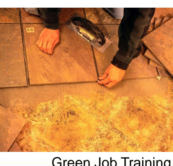
Green Job Training Regional Markets