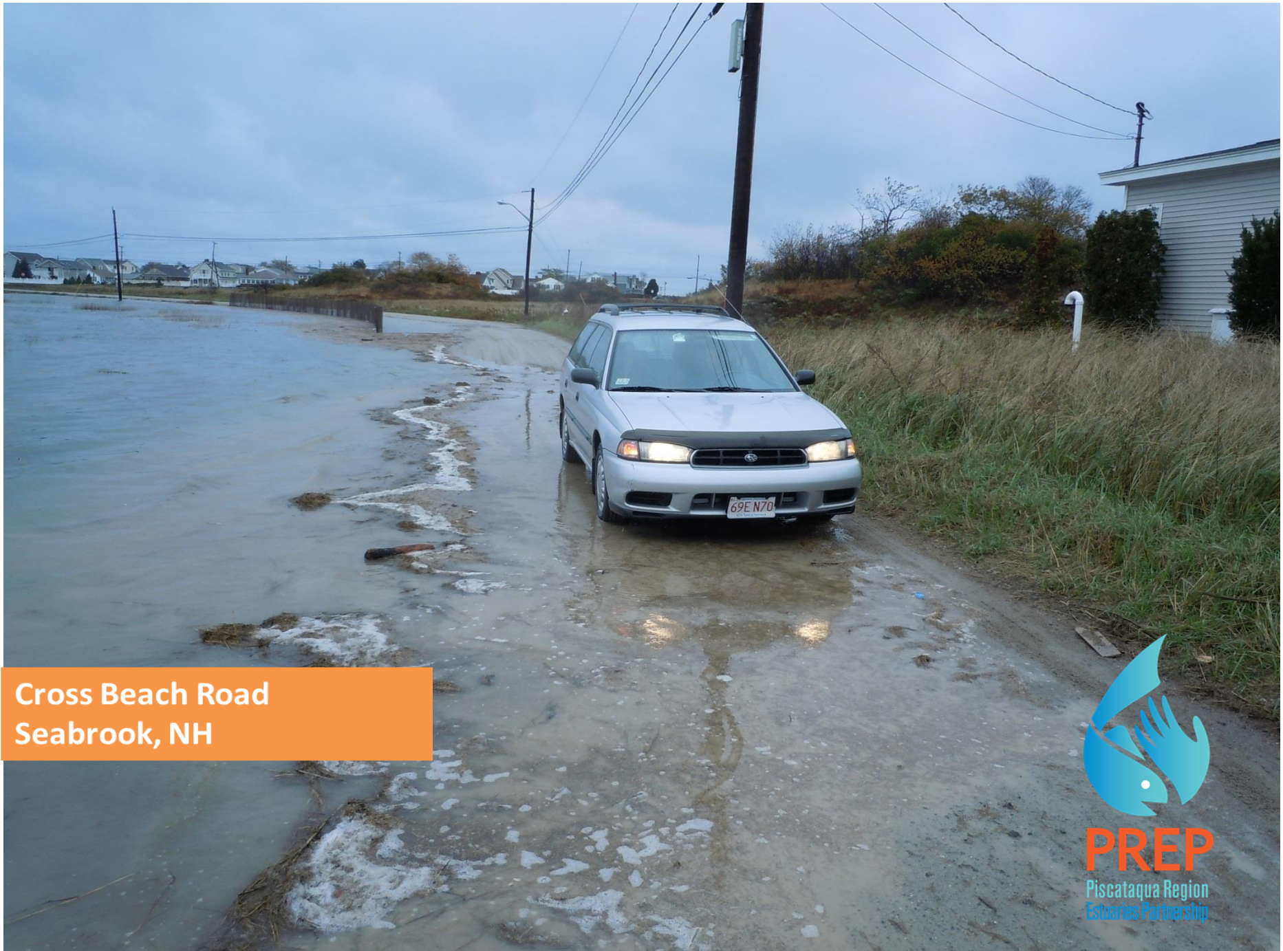
Cross Beach Road Seabrook, NH