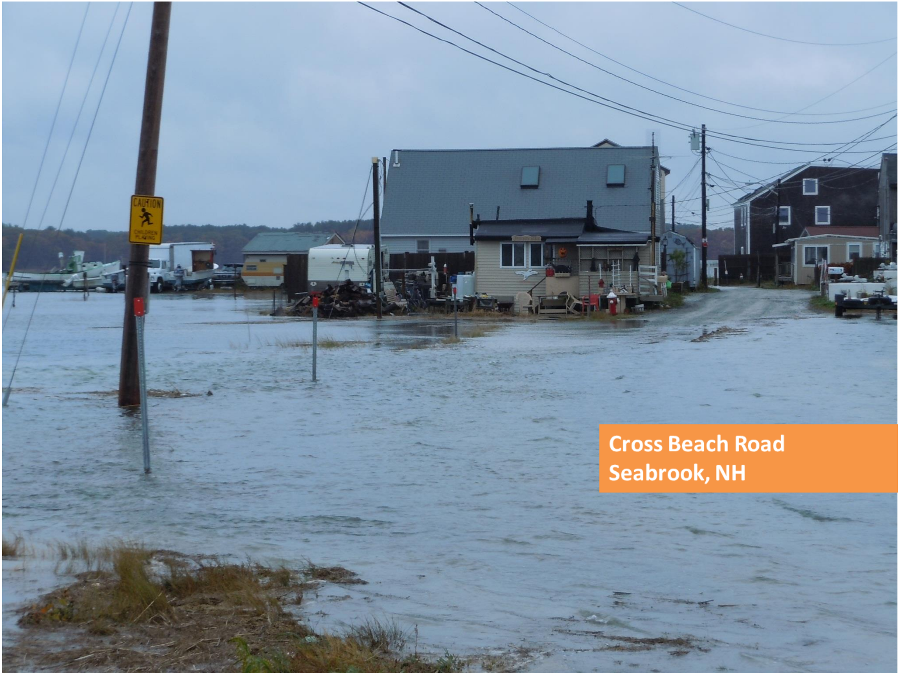
Cross Beach Road Seabrook, NH