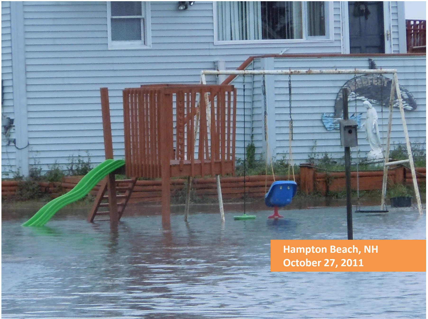
Hampton Beach, NH October 27, 2011