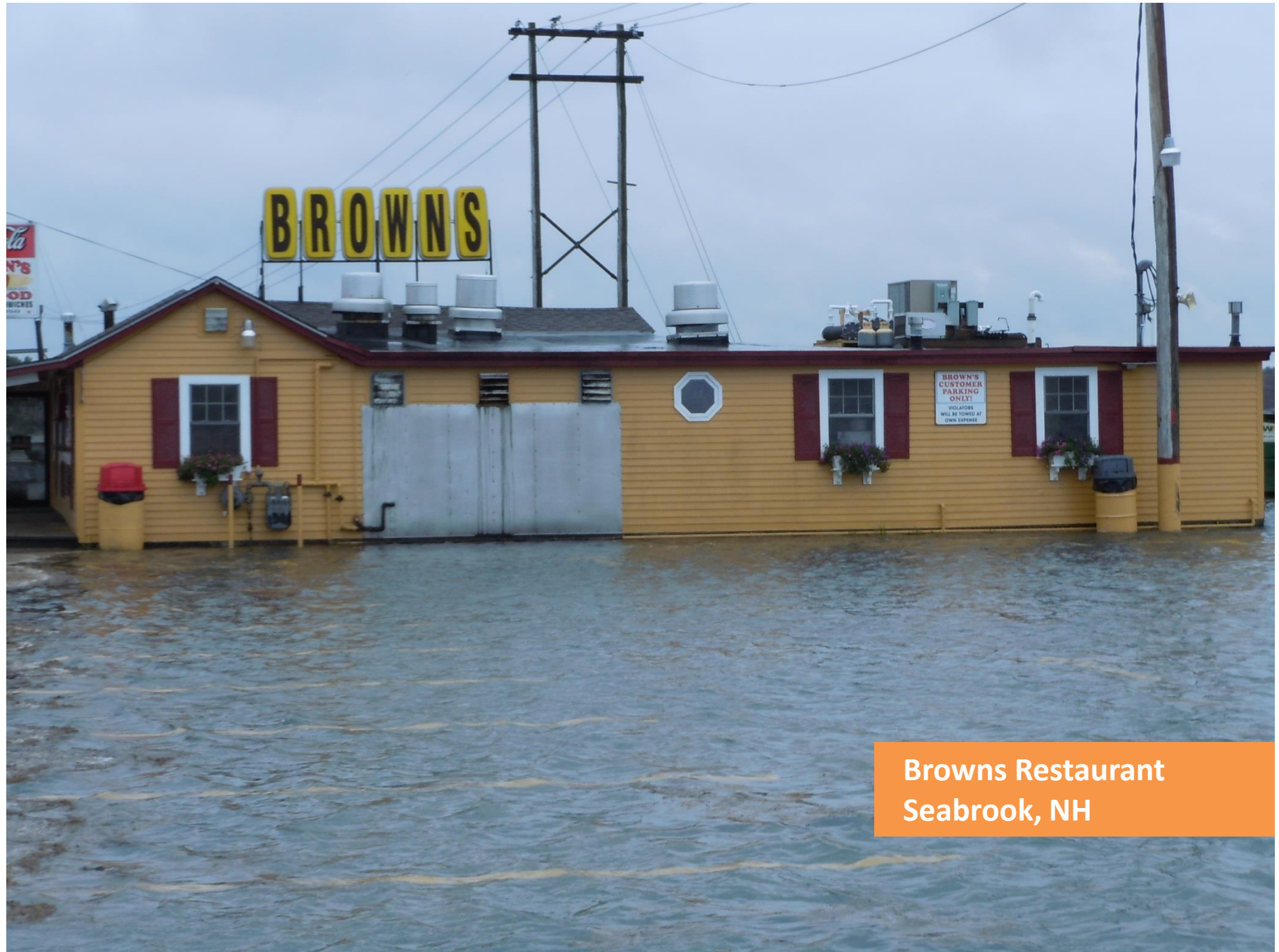
Browns Restaurant Seabrook, NH