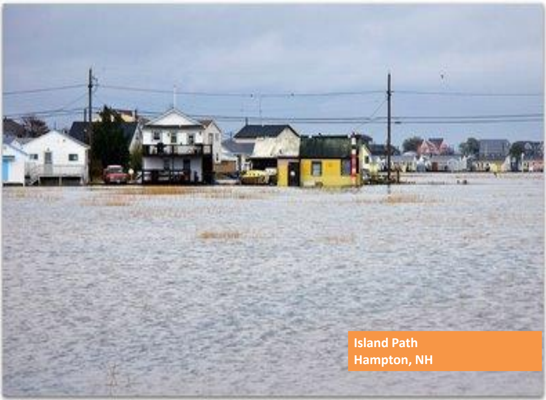
Island Path Hampton, NH