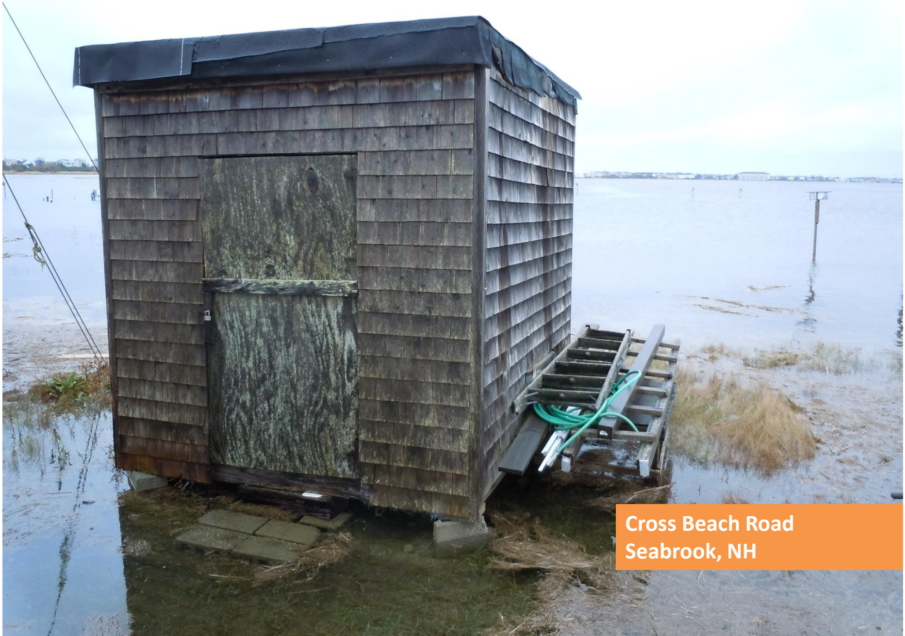
Cross Beach Road Seabrook, NH