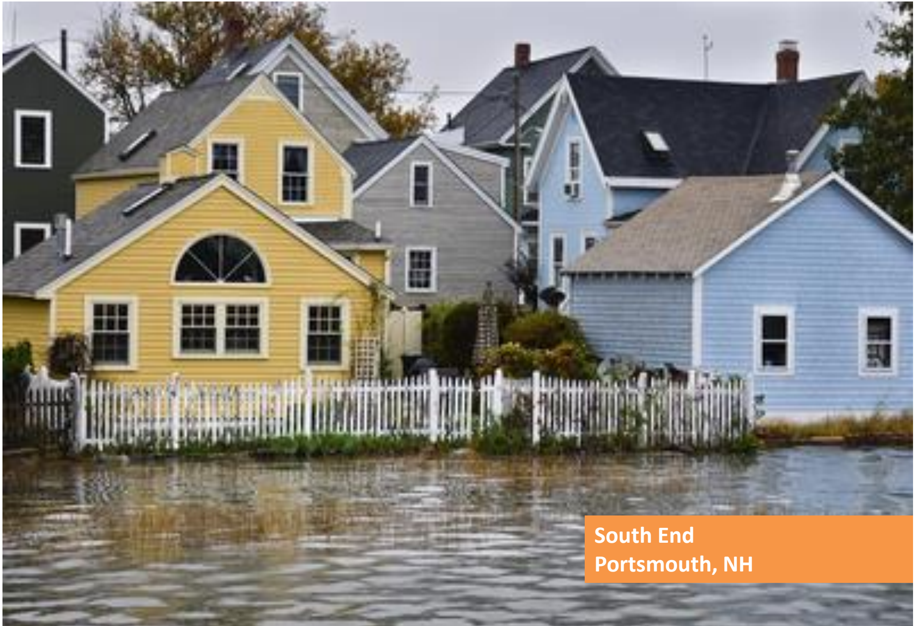
South End Portsmouth, NH