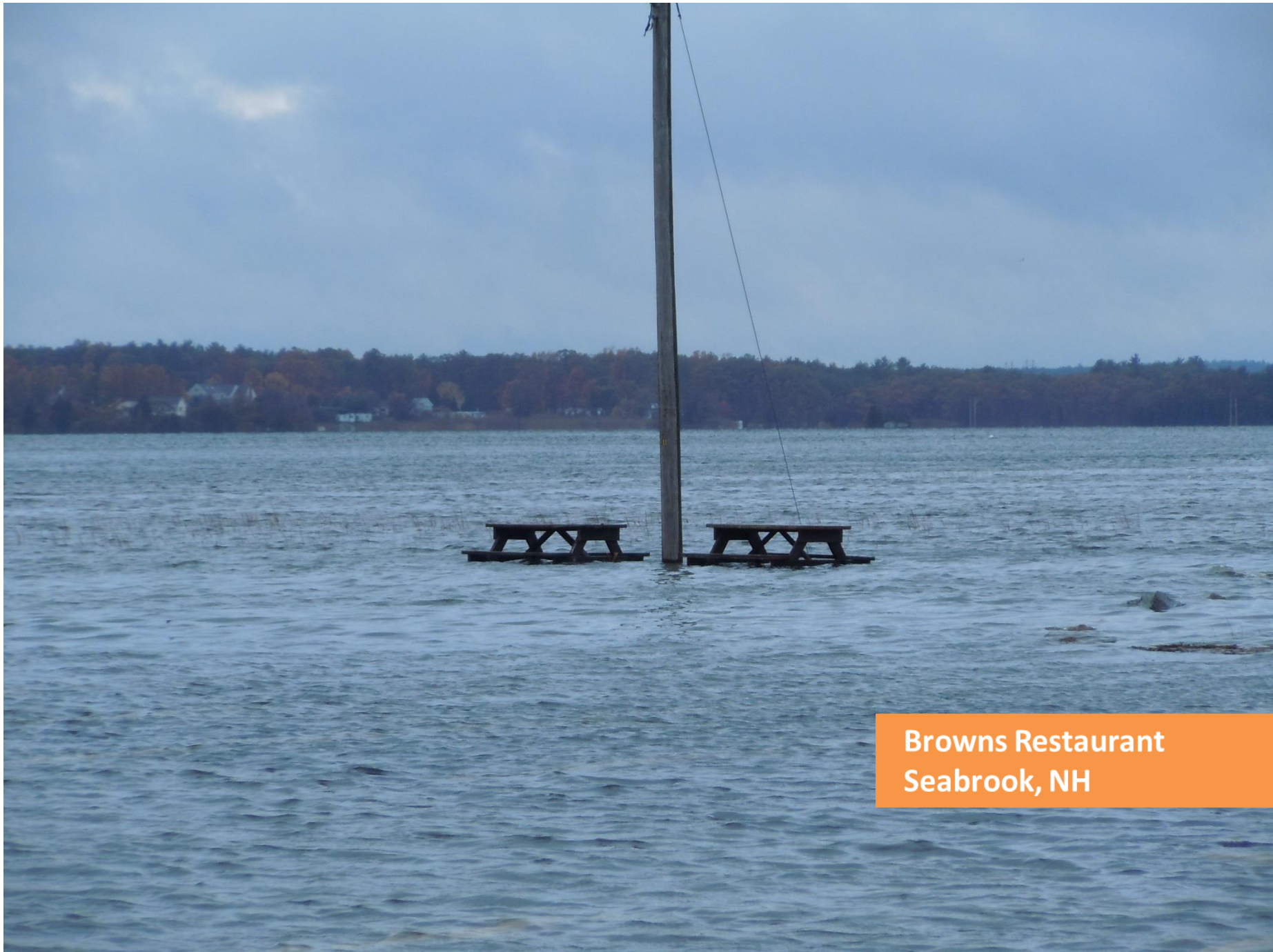
Browns Restaurant Seabrook, NH