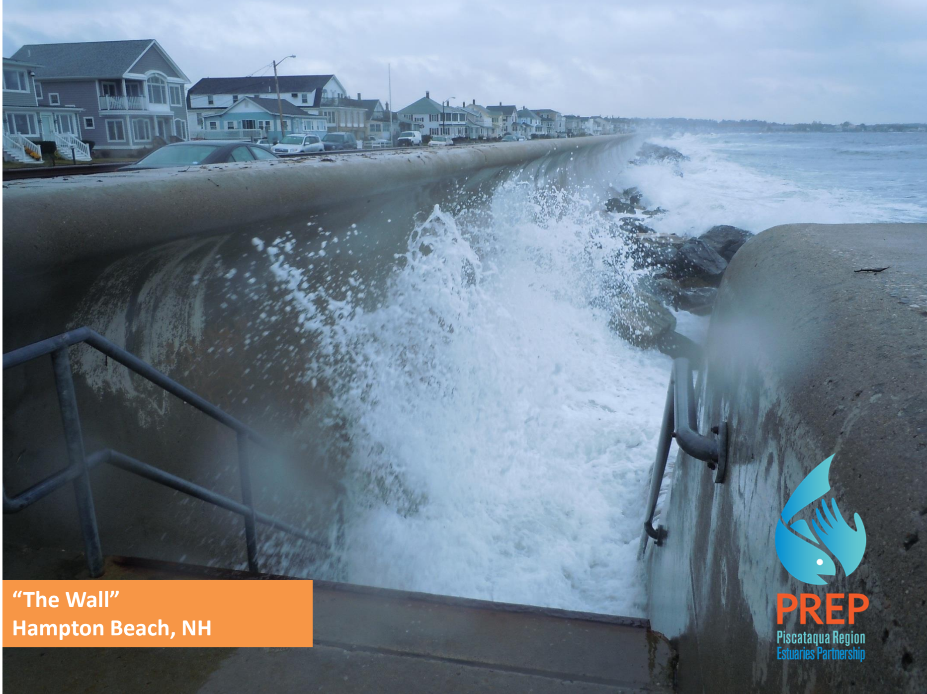
“The Wall” Hampton Beach, NH